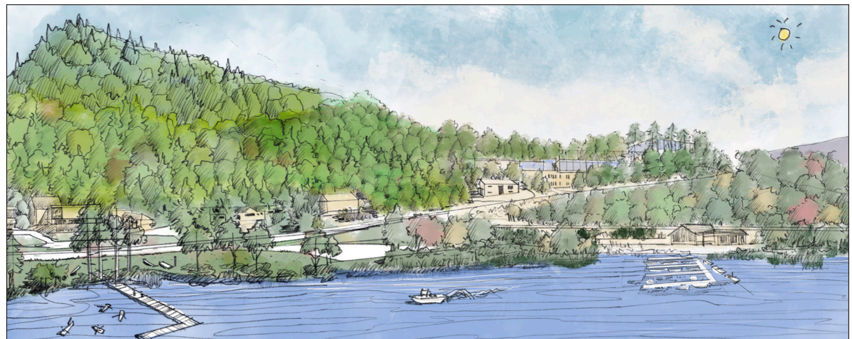
View of the proposed plan from Shawnigan Lake.